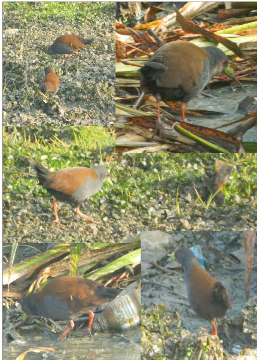
Figure 2: Zapornia bicolor (Walden, 1872) in the study area

intensive developmental activities took place in the area. The manmade loss of original habitat may be estimated to be more than 90% (80-90% was reported by NEPA in 2012) if species' current refuge (around 1.5 hectares; Site 1 + Site 2) and the total wetland area of the locality is to be considered. The remaining wetland habitat for Z. bicolor is also highly affected due to pollution, siltation, growth of invading Eichhornia crassipes , defunct reed beds (made for the purpose of purification of water) with growth of invading Phragmites , and reported encroachment. This might