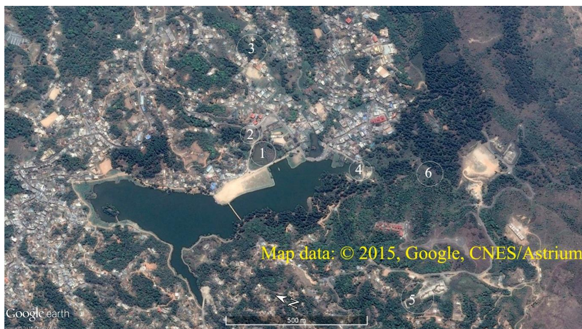
Figure 3: Aerial view of Samendu Lake and reported habitats of Zapornia bicolor in surrounding wetlands; 1-2=Aquarium compound and School Dara, 3=Bhanu Tol, 4=Devi Sthan compound, 5=Rai Dhap, 6=Social Forestry compound.

For proposing the conservation site, habitat options are also very limited. A large area of possible habitat in Rai Dhap (Figure 3[5]) has been concretized from the base and a large tank has been constructed with a hope to supply water to the Municipal residents. Devi Sthan