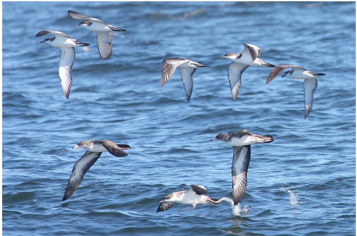
Figure 2: Great Shearwater (lowest bird, with white collar) flying among Buller's Shearwaters and Pink-footed Shearwaters off of Central California.

Table 1: Bird and Mammal species likely to make inter-basin movements based on current range.