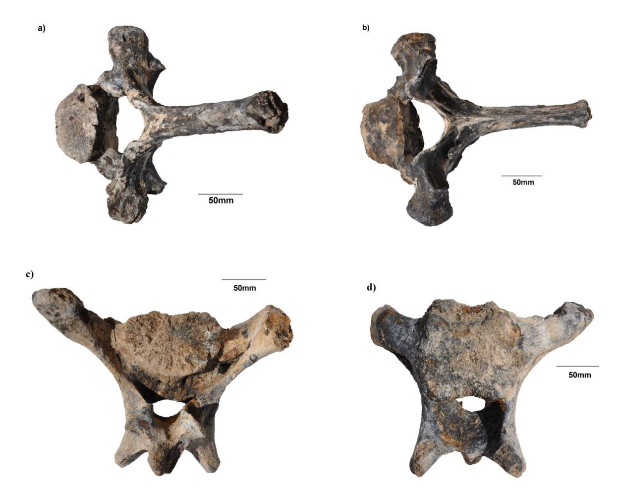
Figure 6 - Cervical vertebra (0742-V) of E. laurillardi: a) caudal view; b) cranial view; Caudal vertebra (V-0757) of E. laurillardi: c) caudal view; d) cranial view.