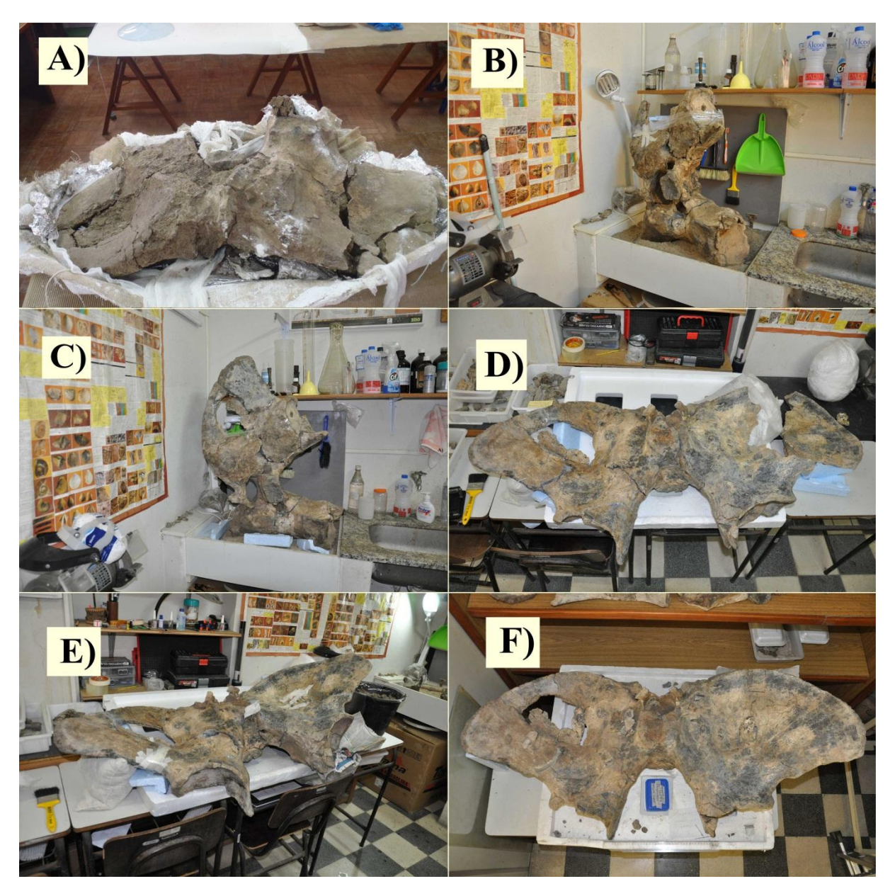
Figure 3 - Preparation of the pelvis E. laurillardi, since the disassembly of the protective plaster (A), cleaning and bonding (B, C, D, E), until the finished piece (F), which was assembled using the adhesive epoxy resin and polyamino-amide.