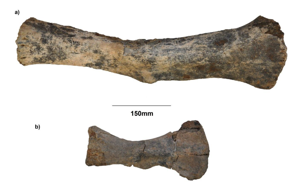
Figure 4 - Left radius of adult (a) and young (b) E. laurillardi, both in lateral view.