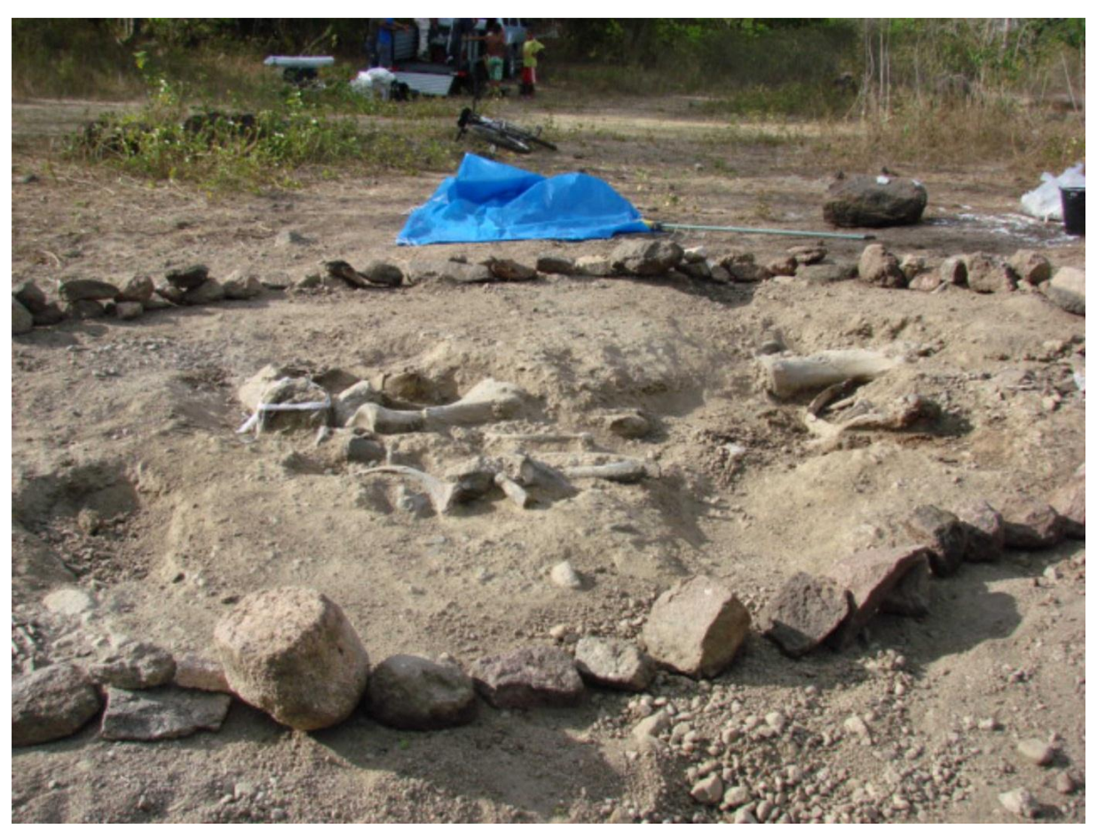
Figure 7 - Fossil in situ in the SP Picos II, where it is observed the degree of packing from loose to dispersed.