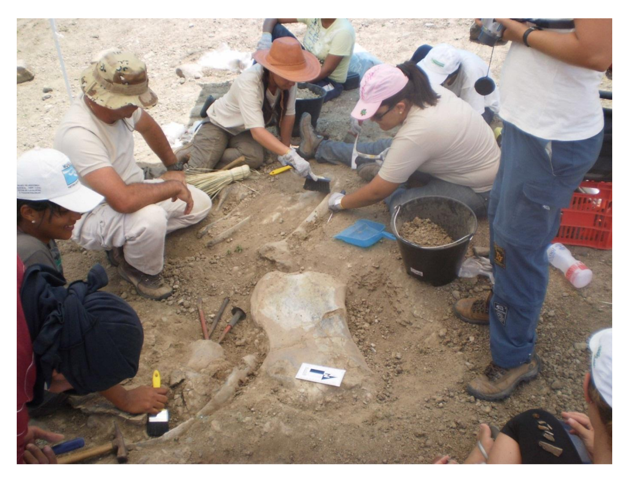
Figure 2 - Fossil material being excavated under the scale observe a femur of E. laurillardi.