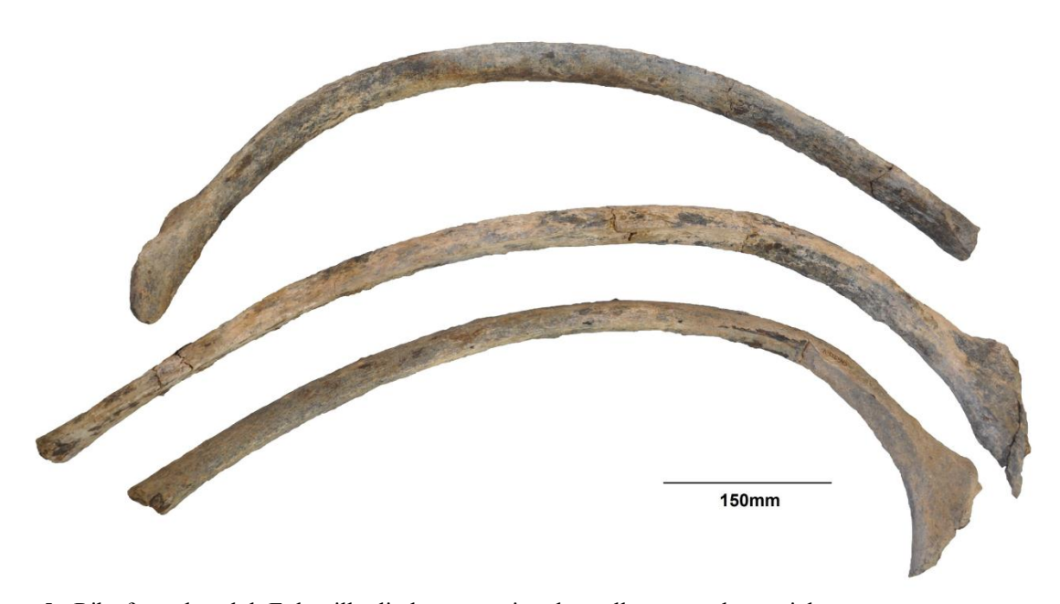
Figure 5 - Ribs from the adult E. laurillardi, demonstrating the well preserved material.