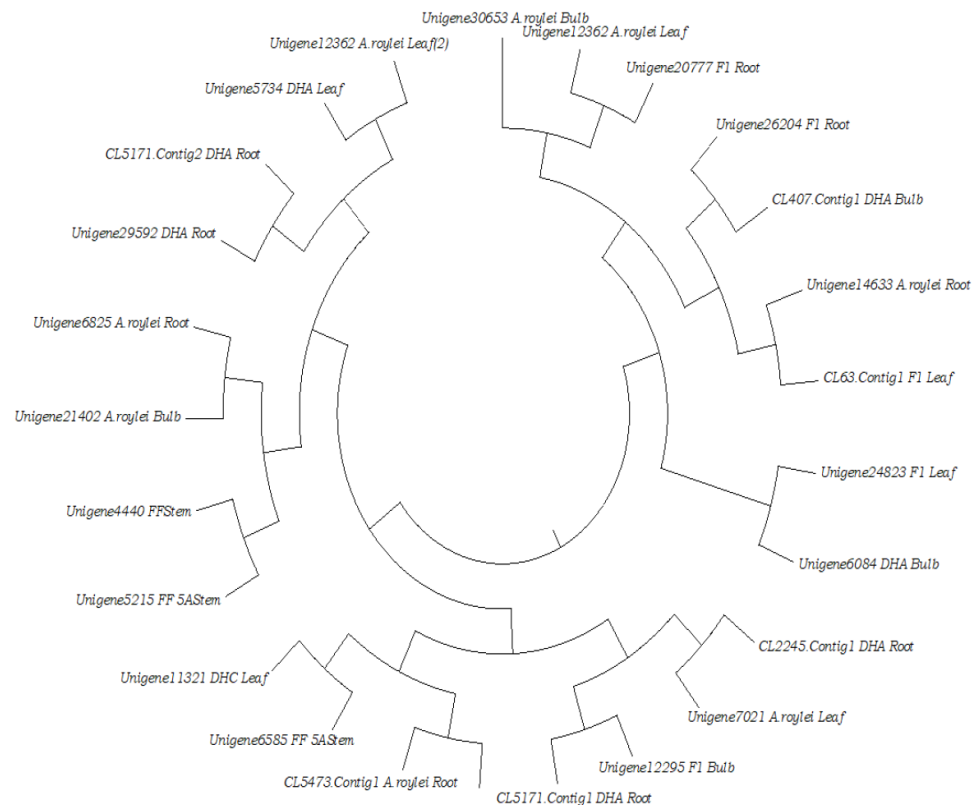
Figure 2 Inferred Ancestral Sequences of WRKY4 like sequences from AlliumTDB.