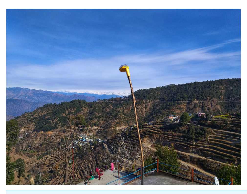
Figure 3 Image of a fox light deployed by regional guardians and researchers at the periphery of human settlements within a village in the Himalaya.