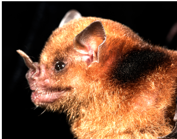
Figure 1 Sturnira parvidens adult male showing dark staining of fur surrounding the shoulder gland (Photo credit: Brock Fenton).