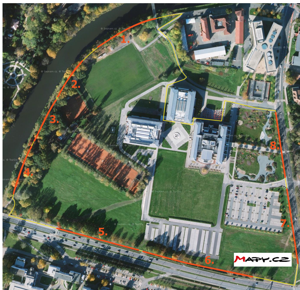
Figure 1 Sections 1–8, where walking speed was measured, are indicated.