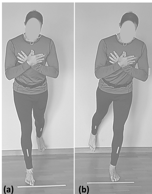
Figure 1 Partial range single leg deadlift test with the left heel (A) and the right heel (B) touching the wall.