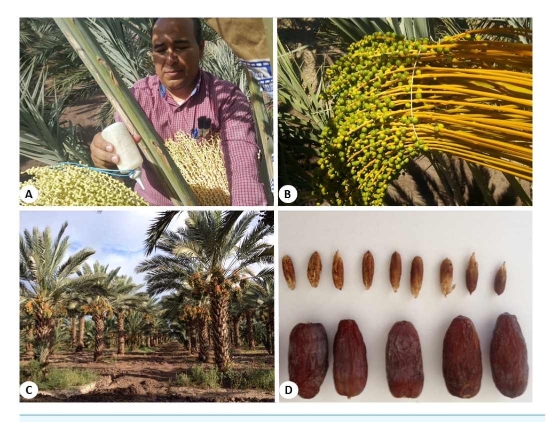
Figure 2 (A) Manual pollination process using a plastic squeeze bottle. (B) View of bunch 45 days after pollination. (C) Panoramic view of a Medjool date plantation in Ejido Jiquilpan, in the Mexicali Valley, México. (D) Fruit harvested in the middle of the Tamar stag.