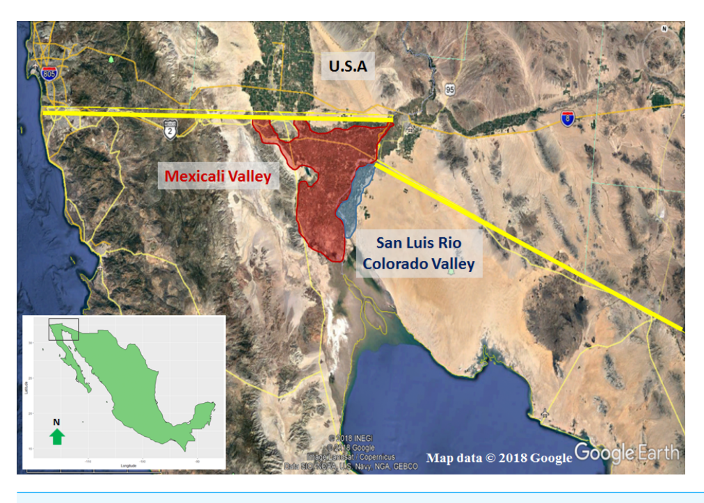
Figure 1 The largest areas of date cultivation in México are found in the Valleys of San Luis Rio Colorado, Sonora (area in blue) and Mexicali, Baja California (area in red). Full-size 🖬 DOI: 10.7717/peerj.6821/fig-1

factors have been documented. However, commercial date production in Mexico is a relatively recent development, and documentation of the characteristics and nutritional value of Mexican-produced dates is needed.