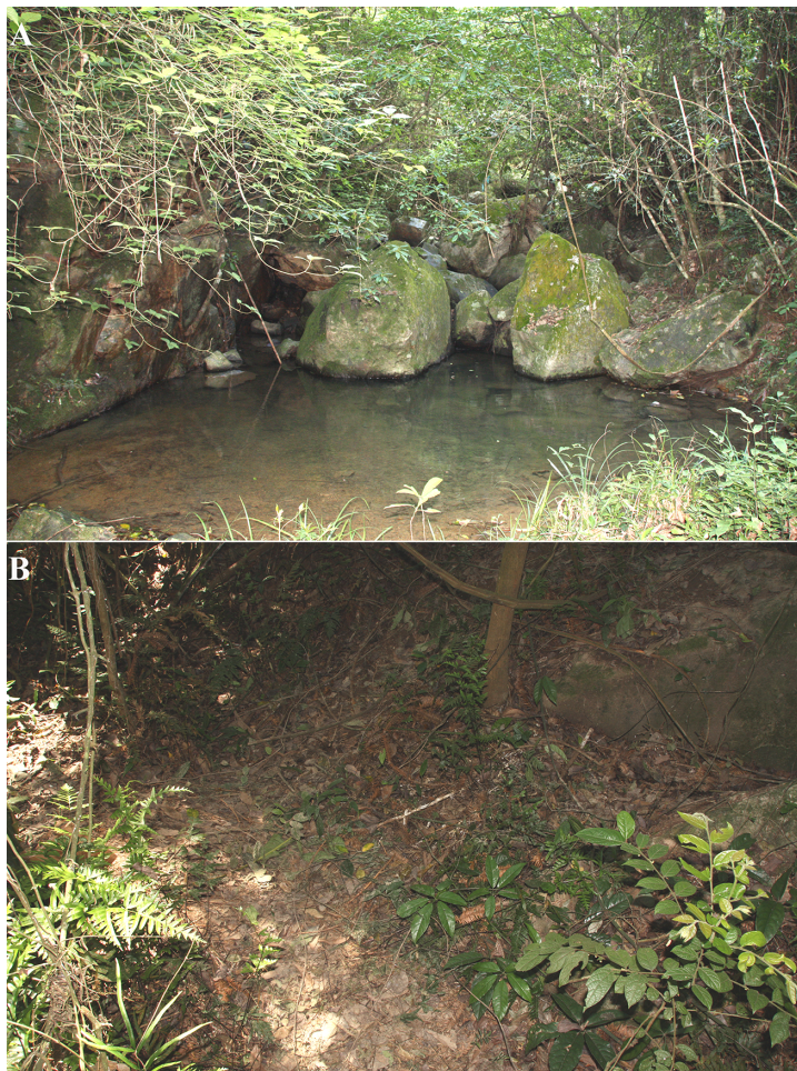
Figure 1 Natural habitat of S. bealei . (A) An ideal stream habitat with many big stones; (B) A typical nesting site in the nearby forest, covered by heavy canopy.