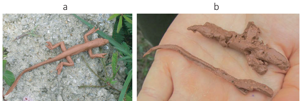
Figure 2 Clay model of a brown anole used for estimating predation pressure. Photograph of a clay Anolis model used for estimating predation pressure: (A) an intact model; (B) a recollected model with predation marks. Full-size DOI: 10.7717/peerj.4722/fig-2

the total number of recollected models, per population. Data on the proportion of attacked clay models could be collected for nine A. sagrei populations only.