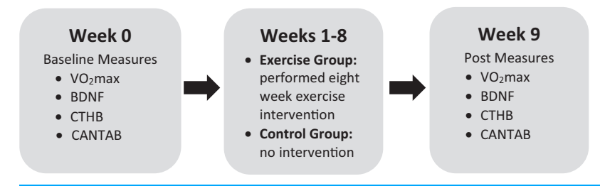
Figure 1 Experimental timeline.

possessing high levels of concurrent validity and test–retest reliability ( Fowler et al. , 1995). CANTAB is an accurate, faster and more efficient method to assess cognitive functioning than traditional pen and paper tools ( Fray & Robbins , 1996). All tests use non-verbalisable patterns and are presented on a computer touch screen in a game-like format that provides immediate feedback to reduce boredom ( Levaux et al. , 2007). The CANTAB tests included in our assessment battery assess executive function, learning and memory which have previously shown to improve following an exercise intervention ( Colcombe et al. , 2004; Erickson et al. , 2011; Ruscheweyh et al. , 2011; Voss et al. , 2010) and to be sensitive to changes in the hippocampus and frontal lobes ( de Rover et al. , 2011;