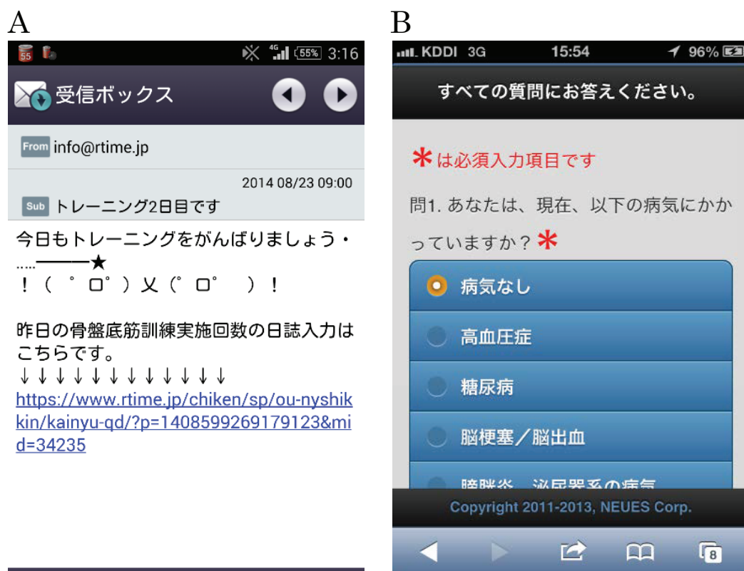
Figure 1 Screenshots of PFMT reminder e-mail and input screen for participant characteristics. (A) Screenshot of PFMT reminder e-mail. (B) Screenshot of input screen for participant characteristics.