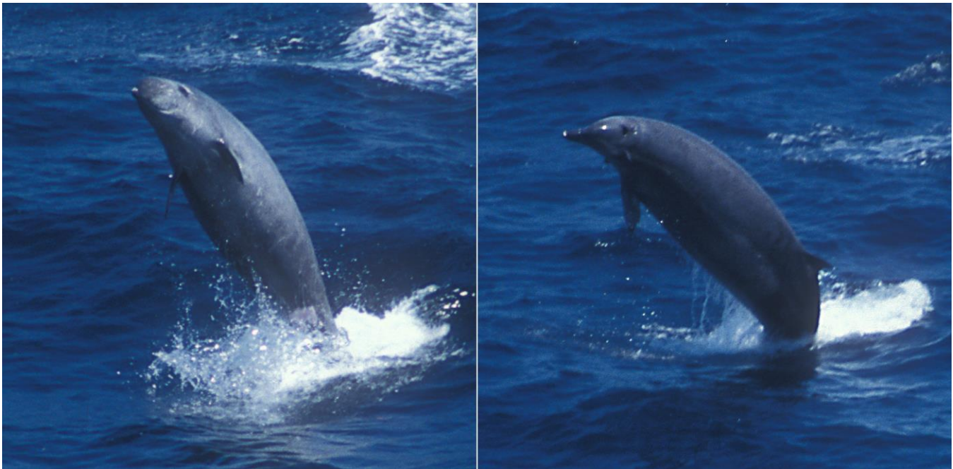
Figure 8. True's beaked whale breaching. Bay of Biscay.