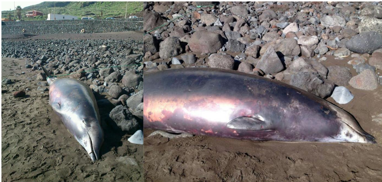
Figure 1: True's beaked whale stranded in El Hierro (Canary Islands) showing a colouration not described previously for this species.