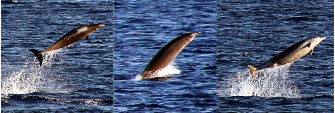
Figure 9: Gervais' beaked whales breaching repeatedly in the Canary Islands (SI Video 2).