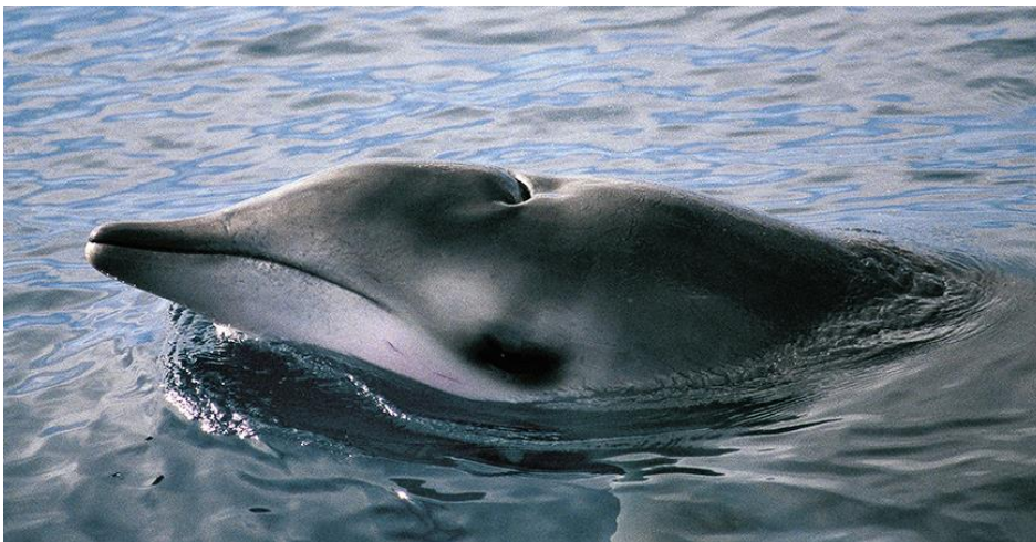
Figure 10. Gervais' beaked whale observed off Tenerife (Canary Islands). Note the head morphology of this whale in comparison with True's beaked whales.