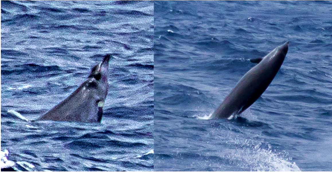
Figure 7: Possible True's beaked whale breaching (Sighting 5, Canary Islands, Table 1).