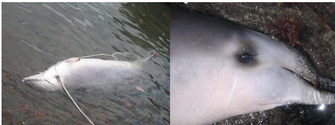
Figure 2: True's beaked whale found drifting off Pico (the Azores).