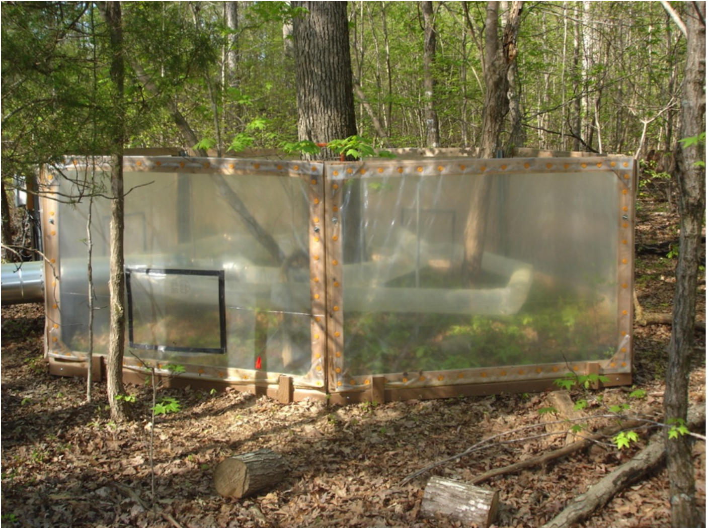
Figure 1. Warming chamber at Duke Forest.