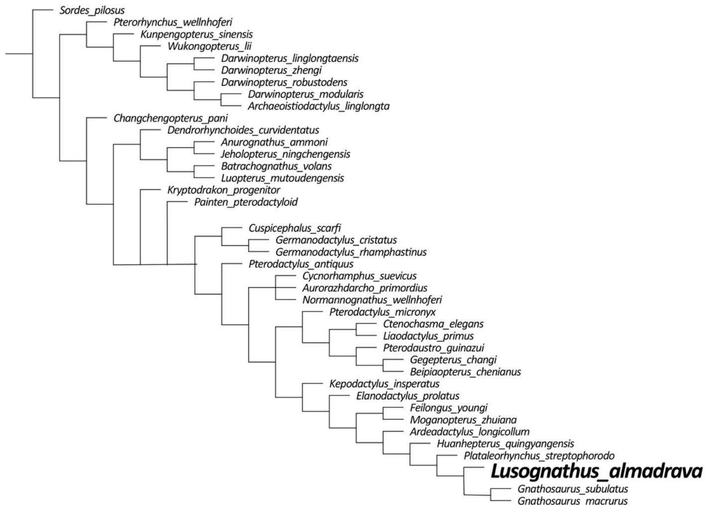
Figure 4. The relationship of Lusognathus almadrava gen. et sp. nov. holotype, and the Pterodactyloidea, after the data matrix by Andres et al., 2021.