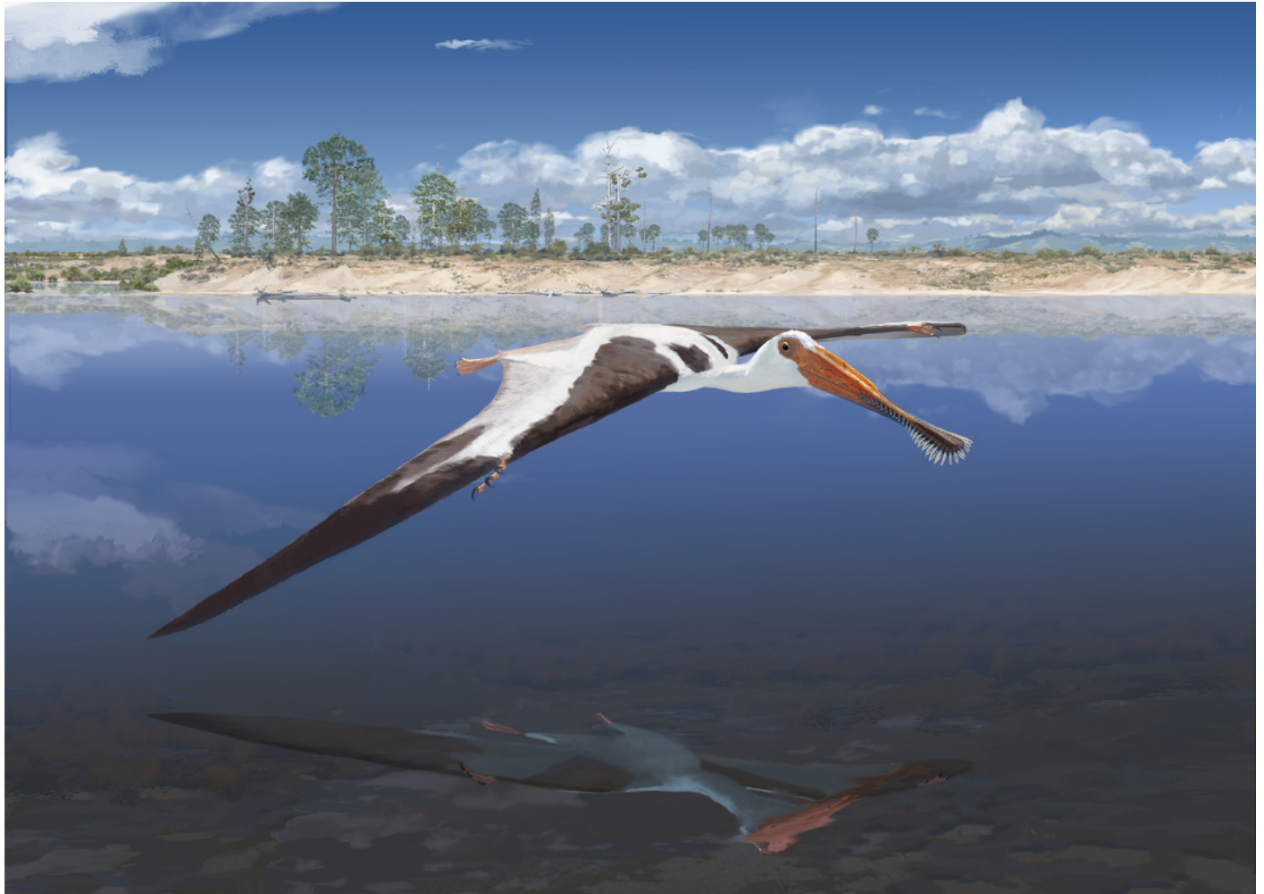
Figure 6. Reconstruction of Lusognathus almadrava and its paleoenvironment by © Jason Brougham