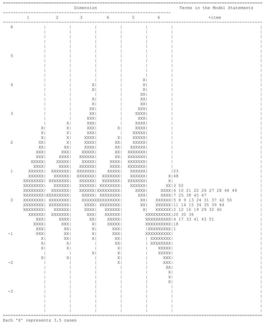
Figure 2 Wright map of TEAQ (52-items). Dimension 1 = FFT; Dimension 2 = CIT; Dimension 3 = ChT; Dimension 4 = ASC; Dimension 5 = AIT; Dimension 6 = AUT.