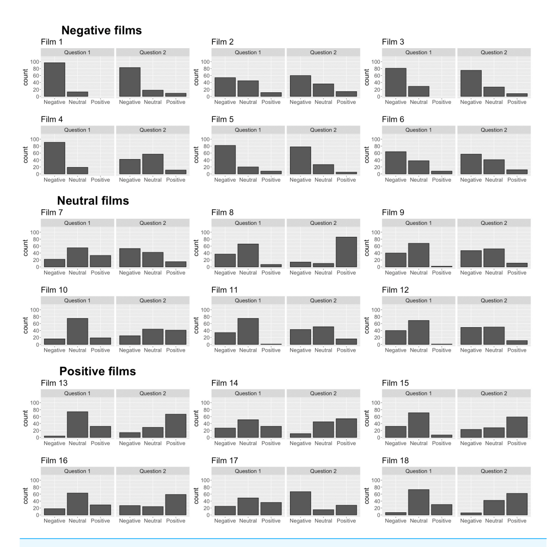
Figure 2 Evaluation of film stimuli for the assessment of social-emotional processing: A pilot study. The histograms show the frequency of positive, neutral and negative answers participants offered to the two questions after each film clip. Films 1–6 were categorised as negatively valenced ambiguous film clips, Films 7–12 were categorised as neutral ambiguous film clips, and Films 13–18 were categorised as positively valenced ambiguous film clips.

Full-size DOI: 10.7717/peerj.14160/fig-2