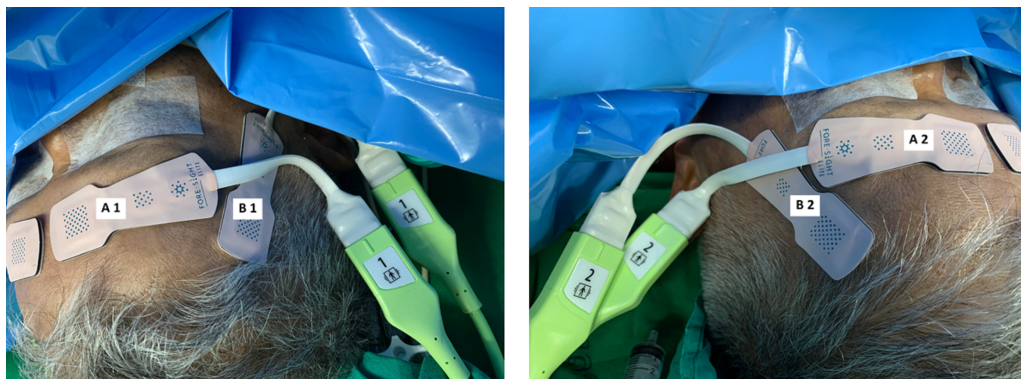
Figure 1 Locations of two pairs of Foresight sensors. (Left) A1 and A2 are the locations for the first pair of sensors on the right and left forehead areas. (Right) B1 and B2 are the locations for the second pair of sensors on the right and left temporal areas. Full-size DOI: 10.7717/peerj.14058/fig-1