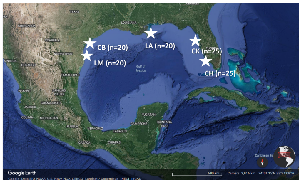
Figure 1 Location of the five study estuaries (stars) throughout the northern Gulf of Mexico. Regions include Laguna Madre, TX (LM), Corpus Christi Bay, TX (CB), the northern extent of the Chandeleur Islands (LA), Cedar Key, FL (CK), and Charlotte Harbor, FL (CH). n represents the number of sites that were sampled within each estuary during the early and late summer 2018.

Full-size DOI: 10.7717/peerj.13855/fig-1