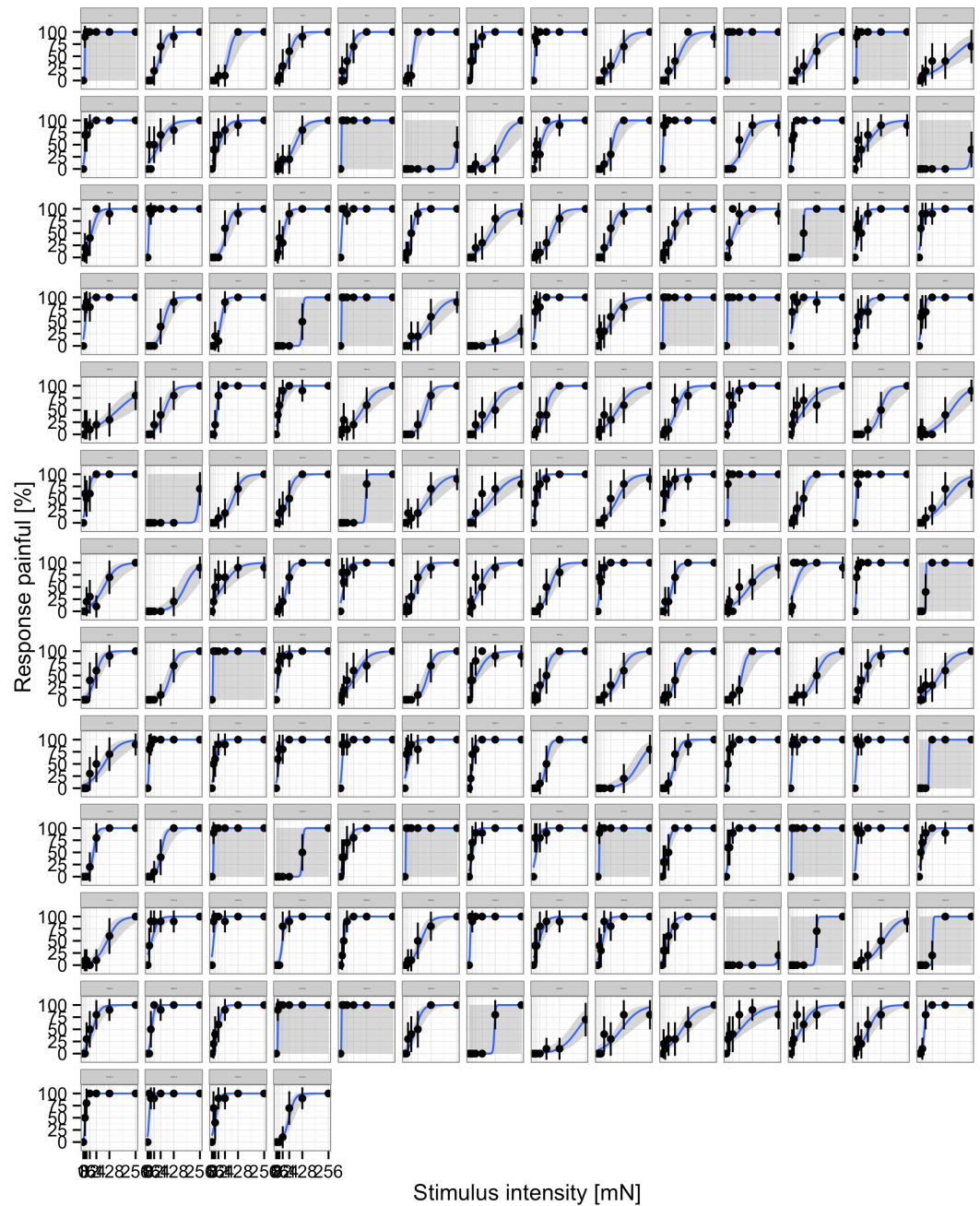
Figure 3 Responses of individual participants. Each panel represents an individual, points represent the average % of responses painful at each stimulus intensity, the blue line indicates the fit to the individual data.

and stimulus intensity as a fixed effect to this model did not result in a significant increase in model fit ( \chi^2 = 1.79 ; df = 2 ; p < .41 ); therefore, these effects were not added to the model. This indicates that there were no systematic differences in sensitivity and response bias between boys and girls. Adding age and the interaction between age and stimulus intensity