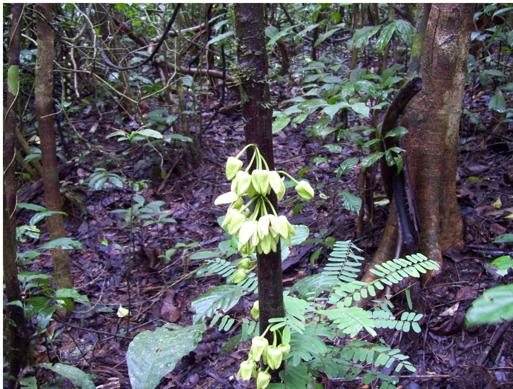
Figure 1 Uvariopsis dicaprio . Cauliflorous inflorescences on trunk.