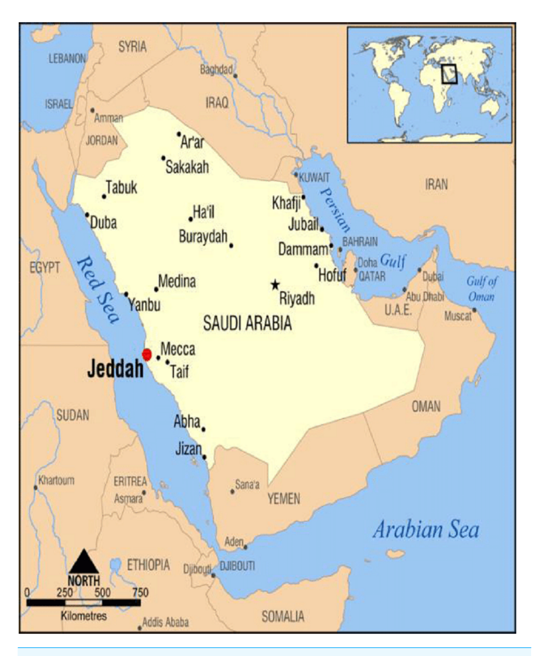
Figure 1 The study area. Map of the study area (Jeddah) from Saudi Arabia. Available via license: Creative Commons Attribution 4.0 International.

Full-size 🖾 DOI: 10.7717/peerj.12596/fig-1