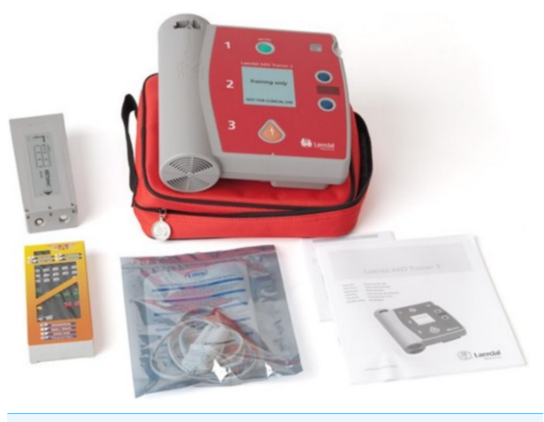
Figure 3 The automatic external defibrillator (AED) device. Full-size DOI: 10.7717/peerj.11761/fig-3