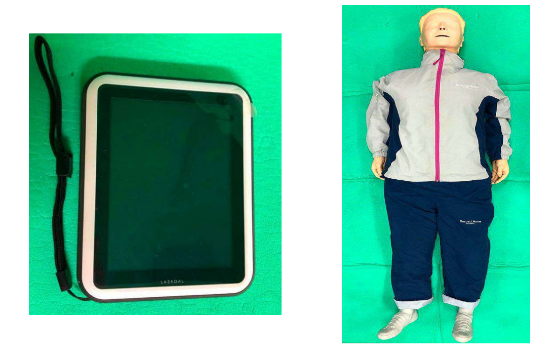
Figure 2 SimPad and Resusci Anne Q-CPR.