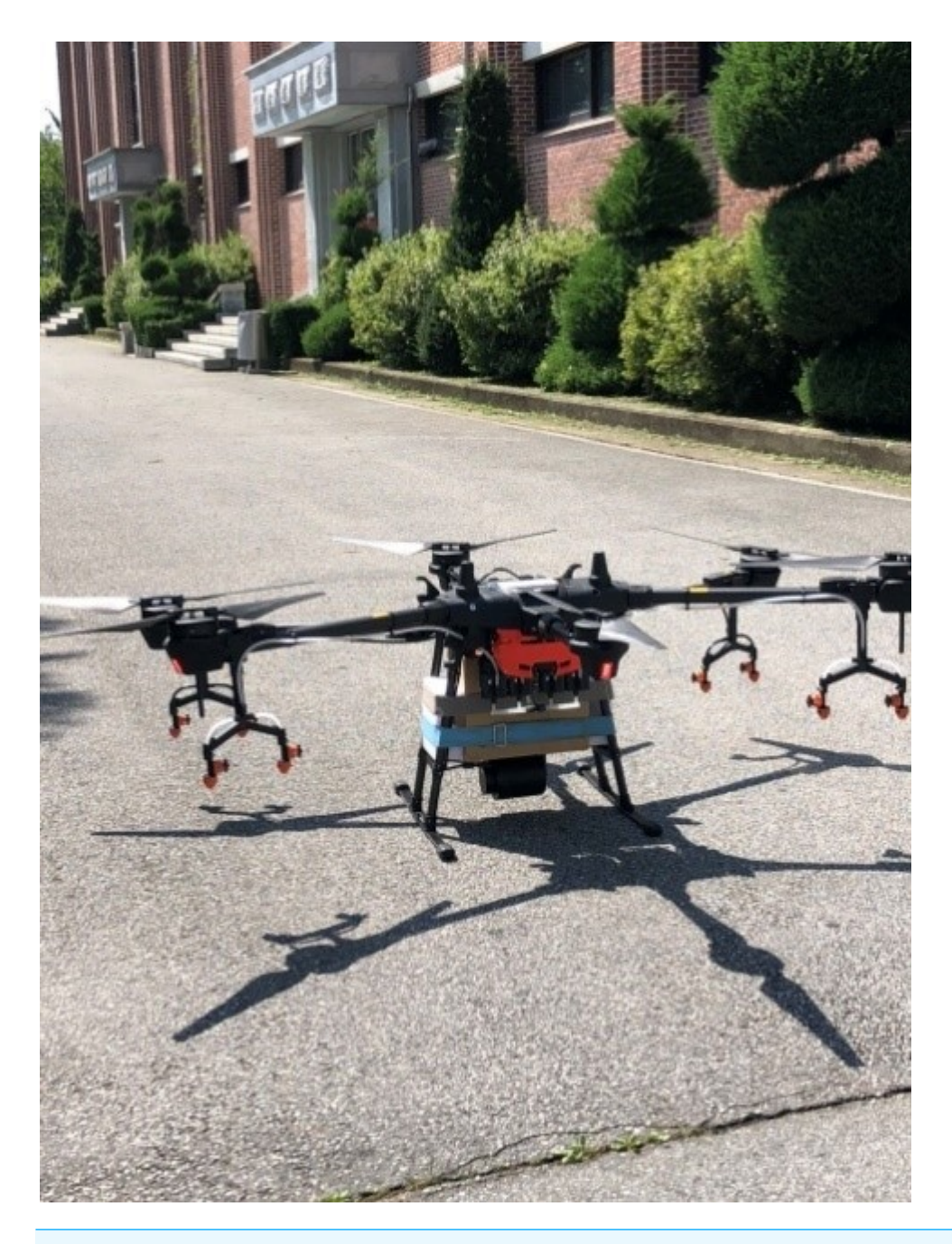
Figure 1 The drone used to transport the AED.

Full-size DOI: 10.7717/peerj.11761/fig-1