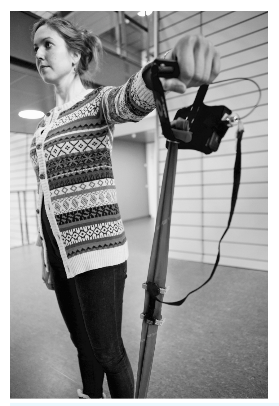
Figure 1 Shoulder abduction with the stretch-sensor attached to the elastic band.

correct exercise form. First, the participants saw the assessor perform the exercise correctly, and afterwards the participants performed the exercise themselves with feedback from a metronome to guide the correct TUT. The participants were given up to five attempts to find the correct TUT by following the beat of the metronome. After the practice, they had a two-minute break before the data collection. Each participant then completed 3 sets of 10 repetitions, with a two-minute beak between the sets. The participants were verbally guided through the test if they did not follow the beat of the metronome, or if they did not use correct exercise form. Therefore, all participants performed the exercise correctly at