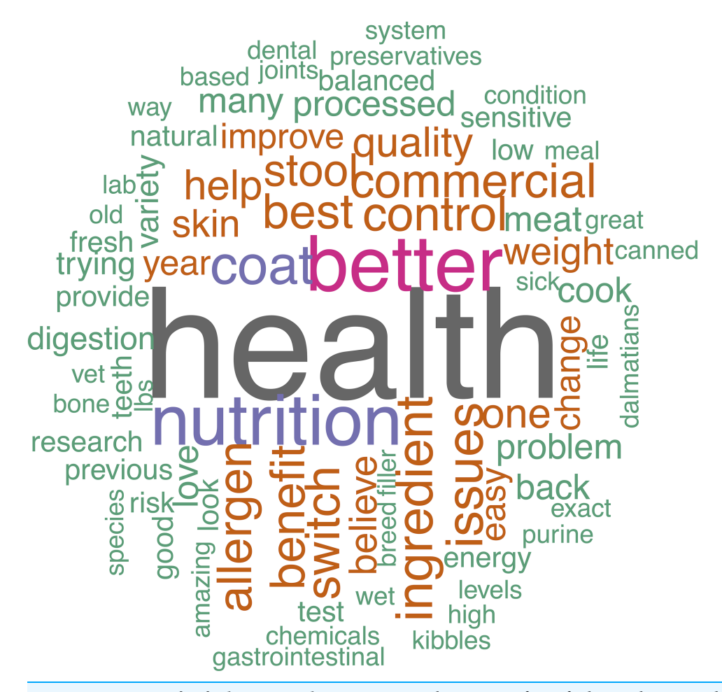
Figure 4 Reasons for feeding a raw diet. Response to the prompt: if you feed your dog a raw diet, why? Full-size ☑ DOI: 10.7717/peerj.10383/fig-4

owners fed homemade raw diets ( Dodd et al. , 2020). A separate survey aimed specifically at raw feeders found that only 15% of respondents formulated their dog's RMBD with guidance from a veterinarian or nutritionist ( Morelli et al. , 2019). The fact that raw feeders are not making a distinction between the nutritional quality of homemade and commercial RMBDs and that many seem to be formulating their dog's diet without appropriate guidance suggests a need for further owner education on the risks of feeding an improperly balanced homemade diet. By comparison, the majority of cooked feeders did distinguish between their assessment of the two preparations, with few of them rating homemade RMBDs as highly nutritious and a larger number rating both commercial RMBDs and CCDs as highly nutritious. It is worth noting that a RMBD being commercially produced is not a guarantee that it is nutritionally balanced, particularly given that legal standards for pet food vary from country to country. The WSAVA recommends only feeding commercial pet food (raw or cooked) from companies that meet specific standards, including the full-time employment of a board-certified veterinary nutritionist ( World Small Animal Veterinary Association Global Nutrition Committee , 2013).