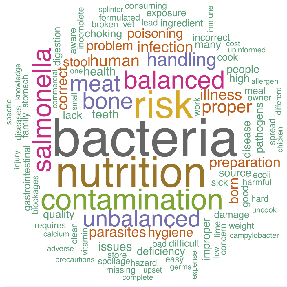
Figure 3 Perceived risks of raw diets. Response to the prompt: what risks are you aware of associated with feeding a raw diet? Full-size DOI: 10.7717/peerj.10383/fig-3