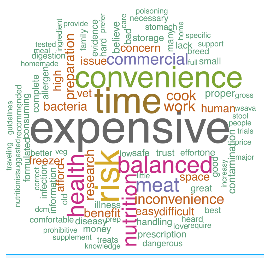
Figure 5 Reasons for not feeding a raw diet. Response to the prompt: if you do not feed your dog a raw diet, why not? Full-size DOI: 10.7717/peerj.10383/fig-5

Unsurprisingly only one in eight raw feeders viewed CCDs as highly nutritious. Cooked feeders demonstrated interesting perceptions of CCDs, with slightly over half of them (n = 164, 52.7%) rating CCDs as highly nutritious; that is an alarmingly low number considering that is the diet they chose to feed to their dogs. When we combine these findings with the top reasons that owners provided for not feeding RMBDs ("time", "expensive", "convenience"), we can postulate that diet choice is multifactorial and that lifestyle factors may be playing a larger role than nutritional value for some owners. This is an area that begs further research to understand exactly why cooked feeders are choosing to feed a diet they do not view as particularly high in nutritional value.