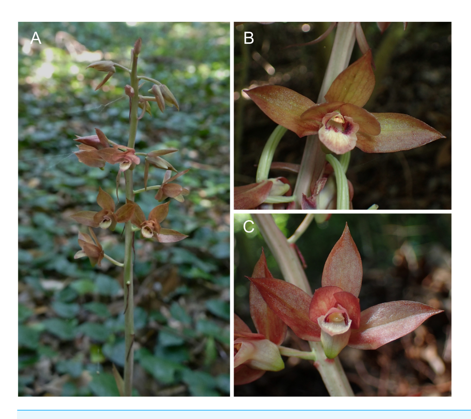
Figure 1 Eulophia zollingeri in its natural habitat. (A) Inflorescence. (B) Hermaphroditic flower. (C) Female flower.

Full-size 🖾 DOI: 10.7717/peerj.10272/fig-1