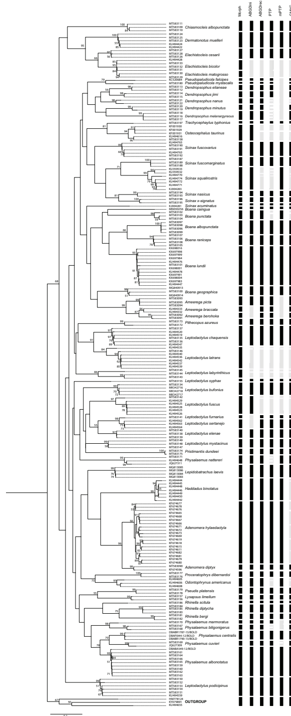
Figure 2 PhyML tree of Anura species based on COI sequences obtained mainly from Mato Grosso do Sul State specimens. The numbers above the internal nodes correspond to bootstrap values of only those higher than 50% are indicated. Black bars represent each species delimited by the following methods: Morph (Morphology), ABGDini (automatic barcoding gap discovery: initial partition), ABGDrec (automatic barcoding gap discovery: recursive partition), PTP (Poisson tree process), mPTP (multi-rate Poisson tree processes), and GMYC (General Mixed Yule Coalescent). Gray bars indicate divergence results from morphological identification.

Full-size DOI: 10.7717/peerj.10189/fig-2