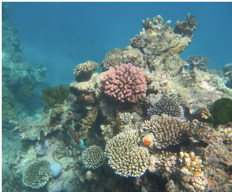
Figure 3 Diverse coral community at Norman Reef in the northern Great Barrier Reef, Australia.